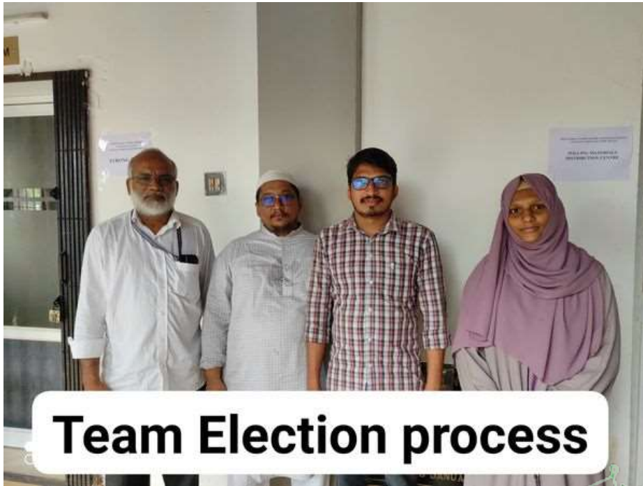
Team Election process